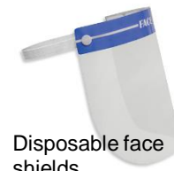
Disposable face shields