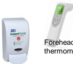
DEB wall mount hand sanitizer